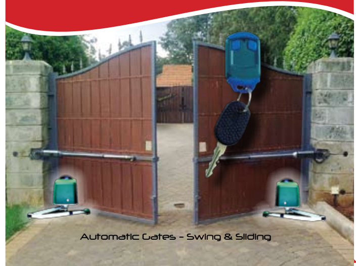
Automatic Gates - Swing & Sliding

TRISOL SOLUTIONS P.O. Box 51230 – 00100 NAIROBI TEL: 020-2620526 - FAX: 020-2620536 Mobile: 0721-533822 Email: support@trisol.co.ke