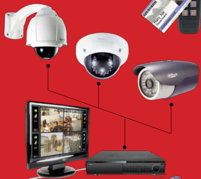
CCTV Surveillance Systems