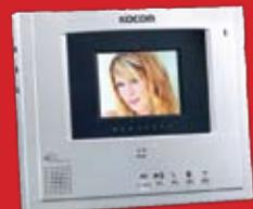
Intercoms & Video Phones