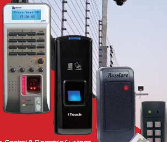
Access Control & Biometric Systems